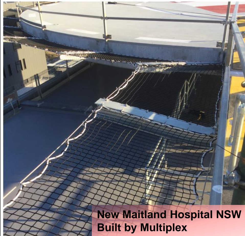
New Maitland Hospital NSW Built by Multiplex