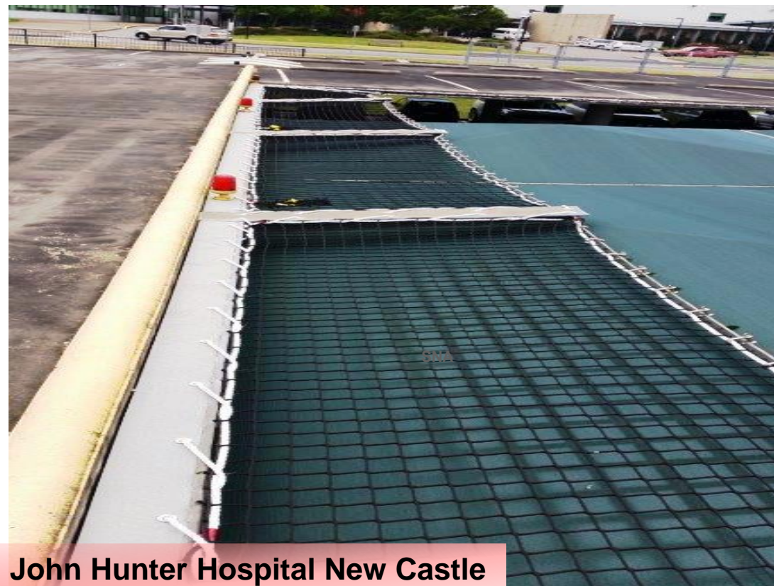
John Hunter Hospital New Castle