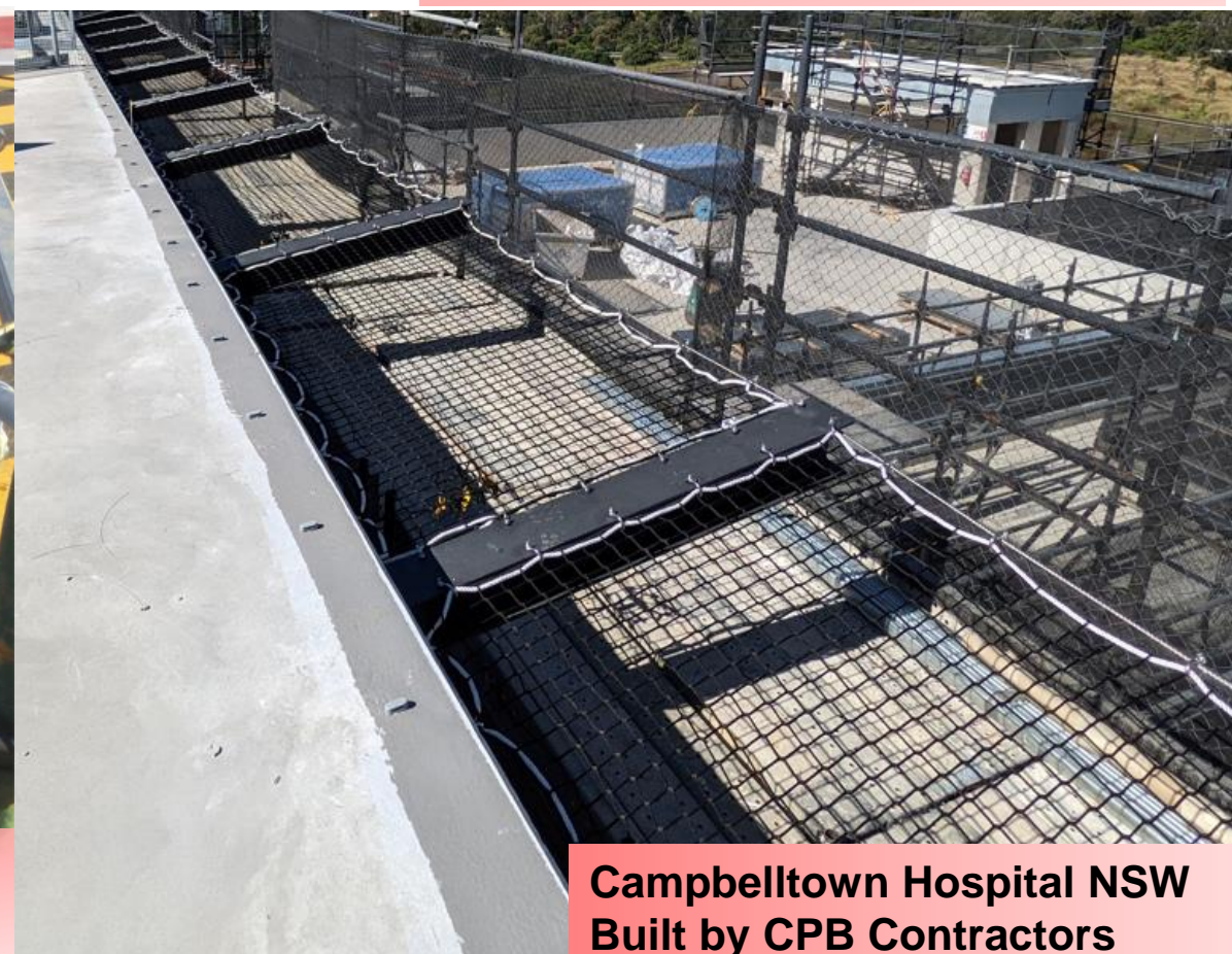
Campbelltown Hospital NSW Built by CPB Contractors