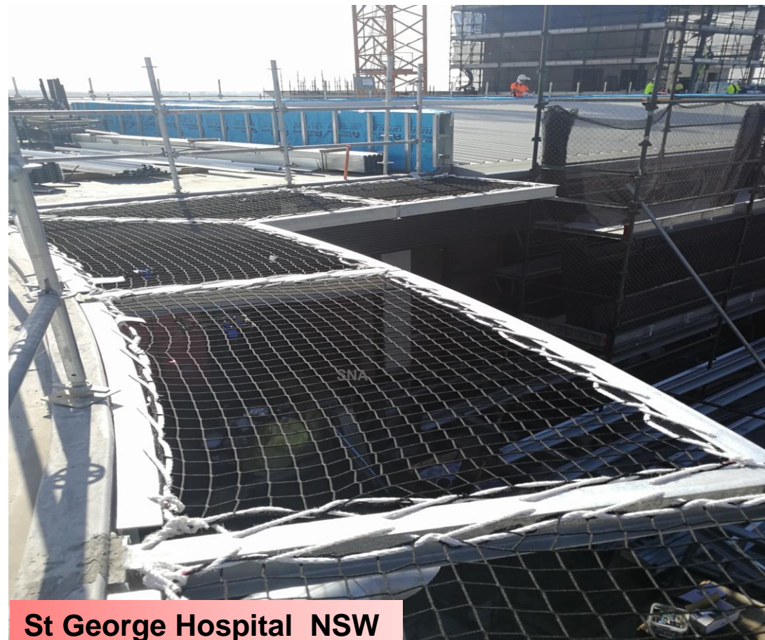
St George Hospital NSW