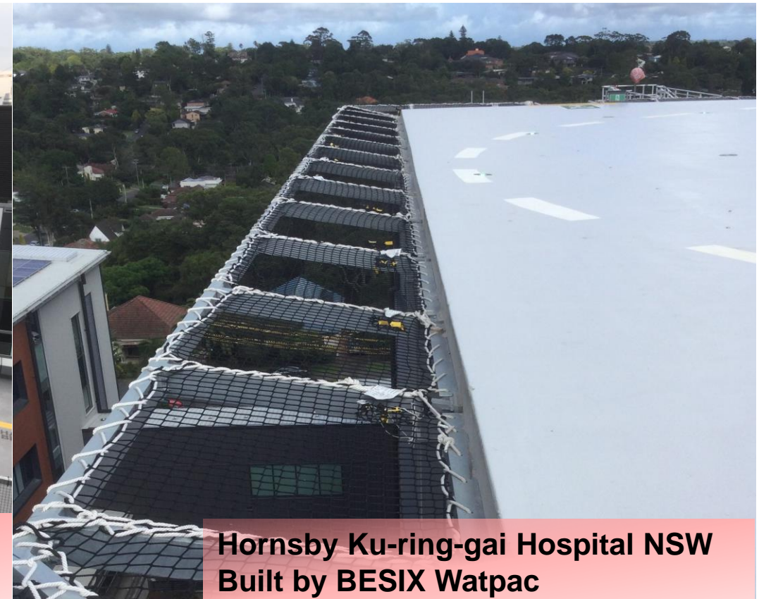
Hornsby Ku-ring-gai Hospital NSW Built by BESIX Watpac