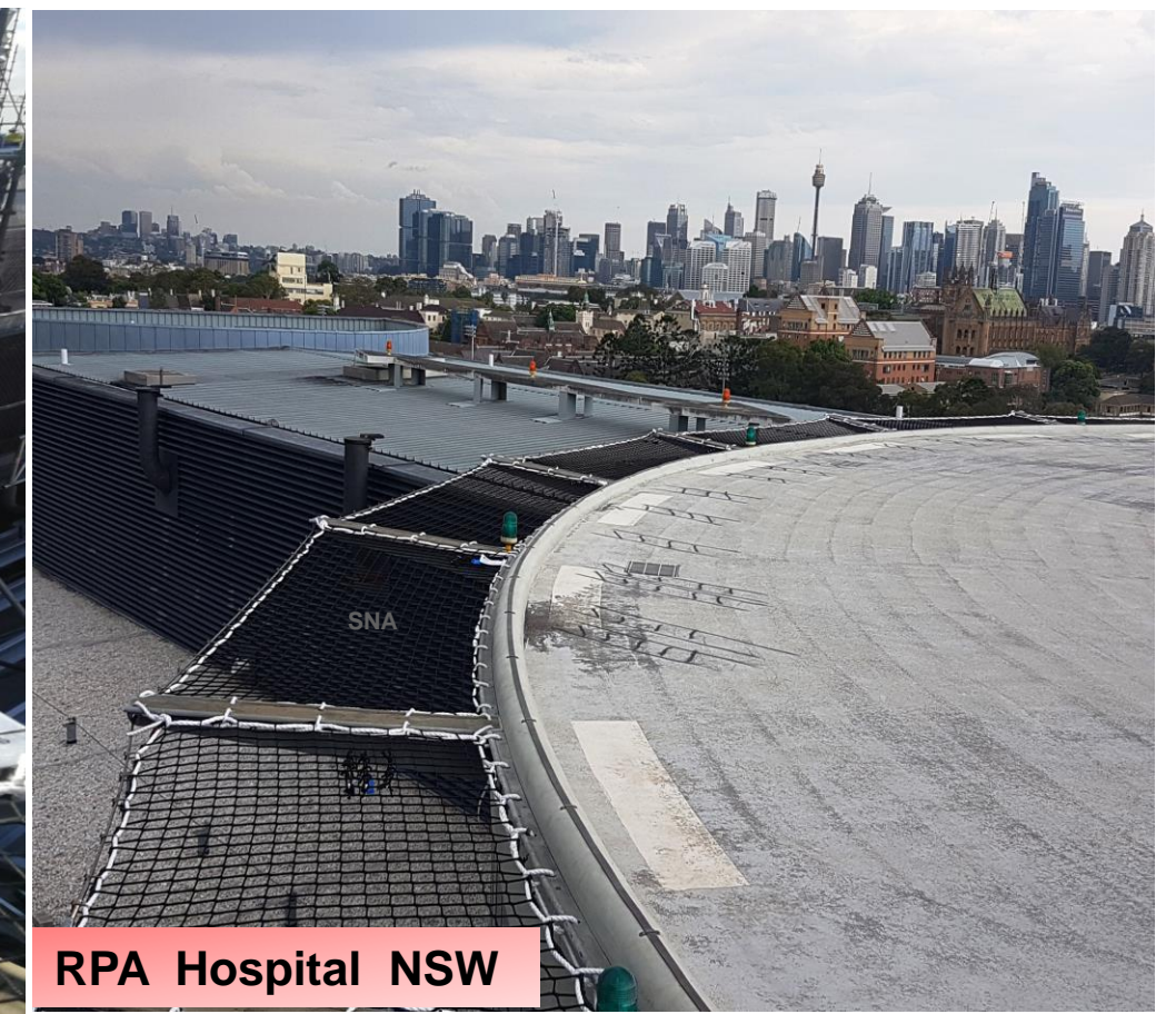
RPA Hospital NSW